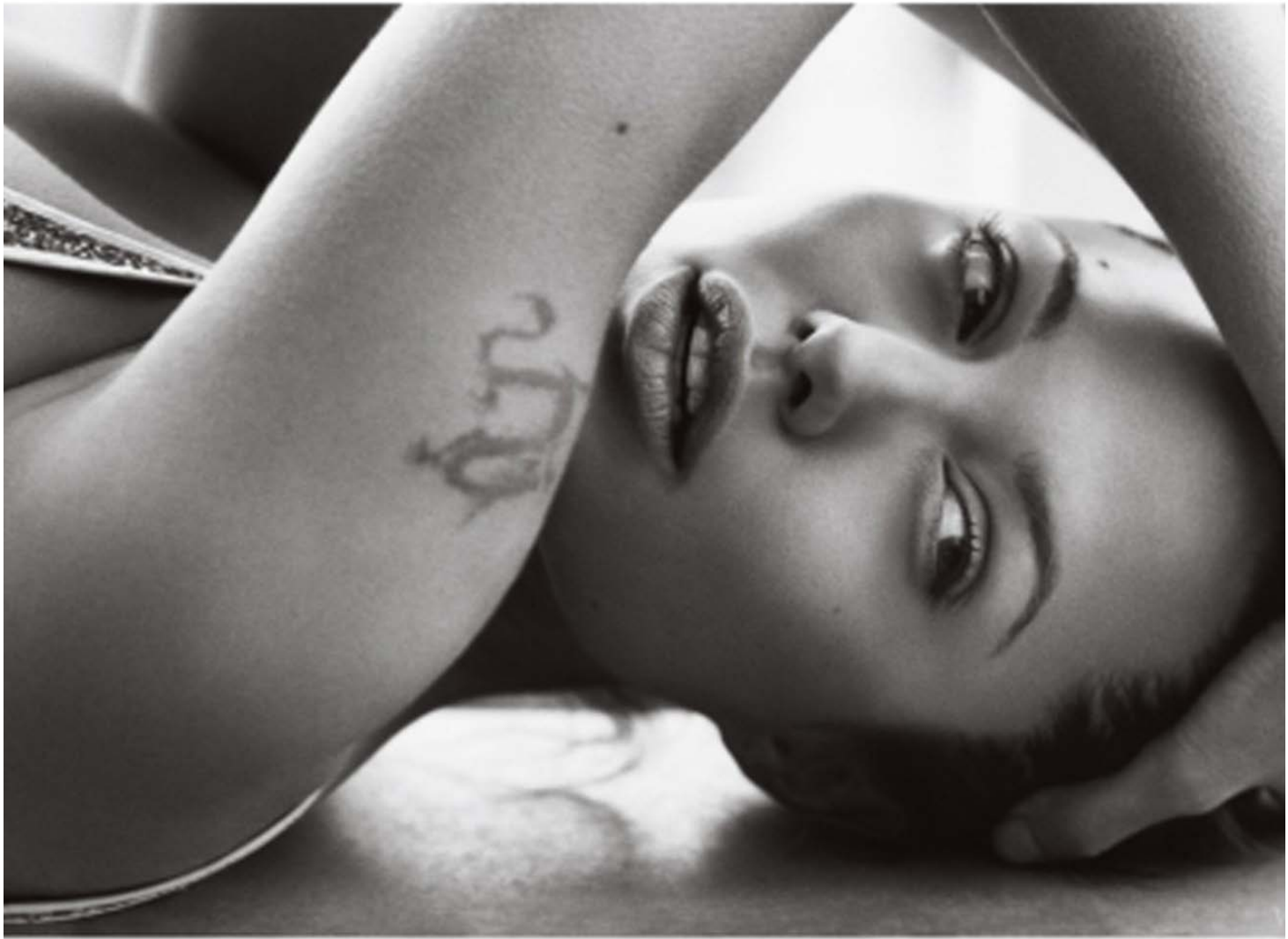
Angelina Jolie - 2004